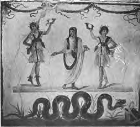
Fig. 27. Genius and Lares.

the community, such unfaithfulness was pitilessly punished; the guilty priestess was buried alive. When the Roman emperor wished to demonstrate that he was the center as well of the religious as of the political life of Rome, he transferred the